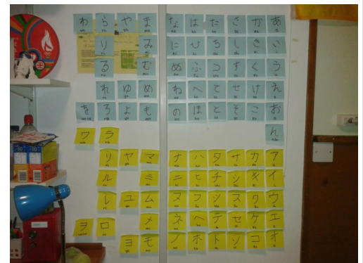
In my room at my accommodation. Trying to learn the Kana!